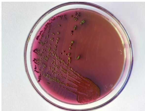
Fig. 1. Morphological characterization of green metallic sheen of E. coli culture on eosin methylene blue agar after 24 hrs incubation

The E. coli was confirmed by PCR by targeting the uspA gene (universal stress protein) following Chen and Griffiths [9] methodology. In the present study, electrophoresis analysis revealed a specific amplification of 884 bp product of the uspA gene (Fig. 2) in test isolates.