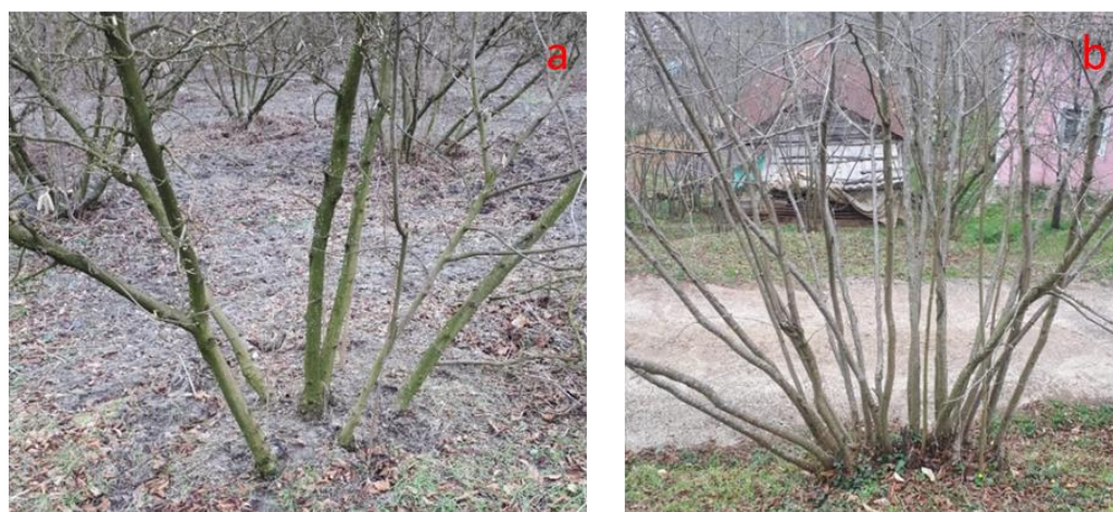
Figure 1. Ocak system with low (a) and high (b) branch density.

cultivation of hazelnuts, and ocaks comprise old and plenty of branches. Ocak is a bush-like growing system that consists of no main trunk as a tree. Branches are all considered as a tree without connecting a trunk. Even though this system is suggested for flatlands by many researchers [4,15,16], cultivation with this system is being used in all growing areas of Turkey. Pruning application is generally performed as removing excessively old branches or newborn suckers and pruning on branches is not performed. In recent years, the studies about the ocak system [17–19] and its effects on yield and quality increased significantly. However, these studies are still insufficient, and there need to be a lot more studies describing the ocak system and its effects. Clarifying the effects of branch numbers in ocak is one of the most crucial issues among all studies. This study was carried out to determine the effect of the number of branches in ocaks on fruit quality parameters in ‘Palaz’ and ‘Tombul’ cultivars.