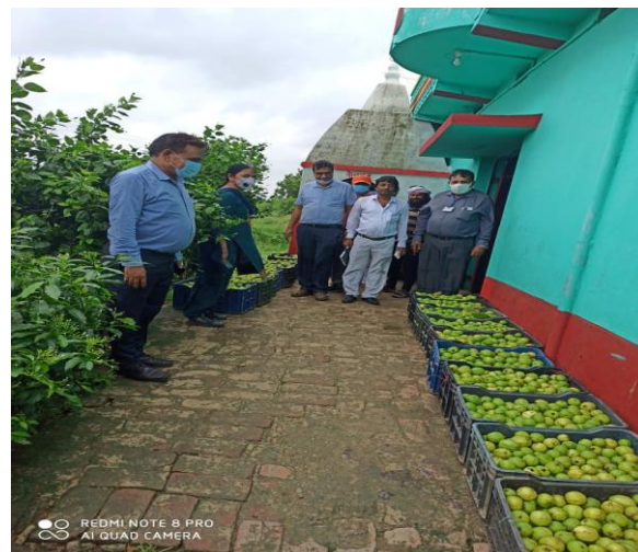
Photographs 1. Photographs of the trail