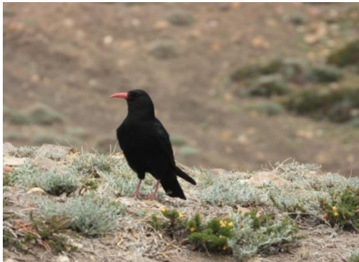
Fig. 5. Pyrrhocorax pyrrhocorax (Red billed Chough)