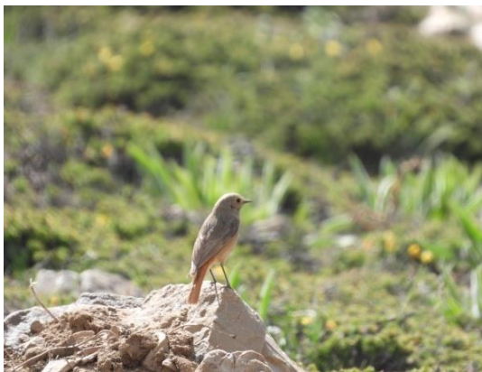
Fig. 1. Phoenicurus ochruros (Female Black Redstart)

Phoenicurus ochruros (Black redstart) is a widely famous bird present in various parts of Europe, Asia, and even north-west Africa. Some of them migrate during winter while others stay in milder areas. They are quite resourceful, nesting in crevices or holes in buildings [17]. They belong to the family Muscicapidae. Female black redstart was spotted first perching on a rock. It had a grey color body having an orange-red colored tail and lower rump which was slightly grey in color than the common redstart. An adult male black redstart was approached, perching calmly on a horizontal branch and photographed. The male black redstart had mostly black and dark grey upperparts with a breast of dark black colour. Its lower rump and tail on the other hand were of vibrant orange-red and the two central tail feathers were of dark red-brown colour. The Black redstart had a super wide range of elevations. It can be found from near sea shore to all the way up to 5000 meters in the Tibetan plateau, which is one of the largest elevational distributions among passerine birds [18]. However, an earlier reference to its presence in Spiti region is available [19] but no previous mention of its sighting in Kibber Wildlife Sanctuary was found.