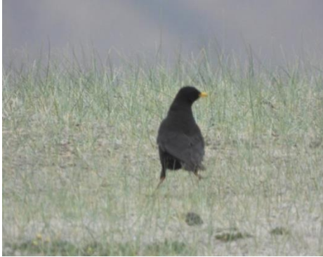
Fig. 4. Pyrrhocorax graculus (Yellow billed Chough)

appears that the alpine regions with rocky desert lands are the preferred habitat for yellow-billed or alpine choughs Pyrrhocorax graculus [20]. The grown-up alpine choughs of the main subspecies have sleek black feathers a small yellow beak, dark brown eyes and red legs [21].