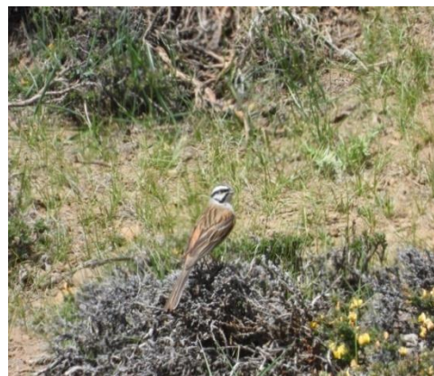
Fig. 3. Emberiza cia (Rock Bunting)