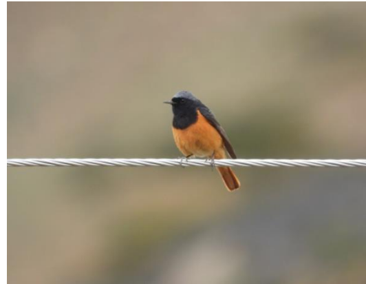
Fig. 2. Phoenicurus ochruros (Male Black Redstart)

buff underparts and pale grey head with striking black striping. There is no descriptive mention of this species inside Kibber Wildlife Sanctuary in the past. It seems that the rock bunting is a polytypic species and resides in the western Himalayas from the central Nepal to Afghan border. During winter it visits the adjacent southern plains. It is quite fascinating how their range extends to different regions.