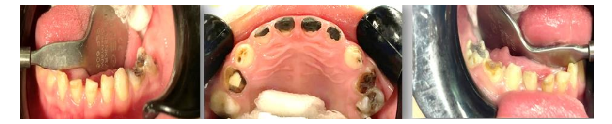
Fig. 2. Intraoral examination showing generalized gingivitis with multiple caries