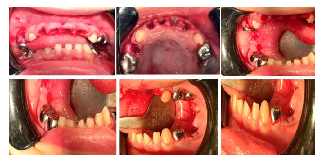
Fig. 4. Postoperative intraoral photos showcasing the outcome of the treatment process