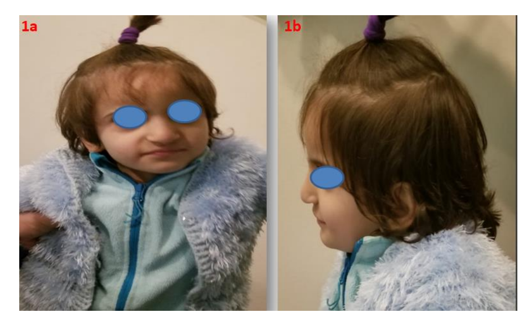
Fig. 1. The patient's extraoral clinical examination highlighted facial features associated with epilepsy and CP. (a) Frontal showing facial asymmetry, and (b) lateral extraoral photographs showing no facial swelling, no palpable lymph nodes, and a normal facial profile (Class I profile)

Based on the findings, the treatment plan included extraction of the upper right first molar, the four upper anterior teeth, and the lower left to extensive decay. second molar due Additionally, pulpotomy and stainless-steel crowns were planned for the upper right second molar, the upper left first and second molars, the lower left second molar, and the lower right first and second molars due to severe decay with pulp exposure. Composite restorations were performed on the upper left and right canines, as well as the lower anterior teeth, where caries were present. Figs. 4 and 5 display postoperative intraoral photos and radiographs showcasing the outcome of the treatment process.