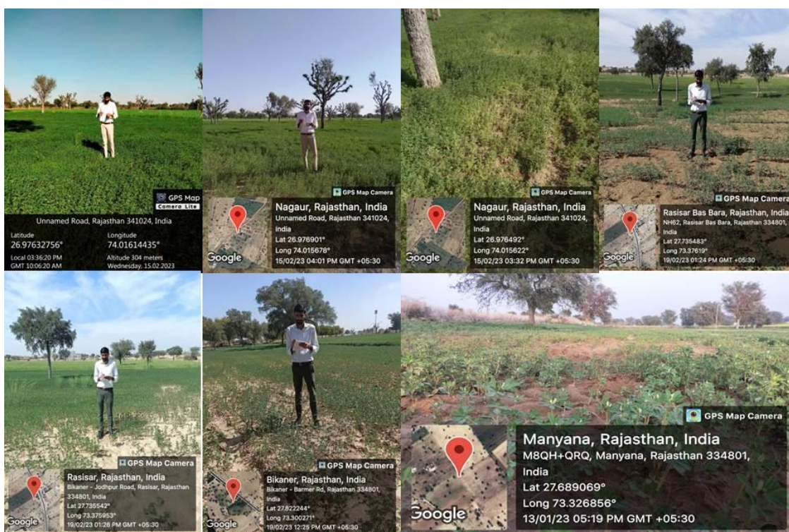
Plate 1. Survey of wilt disease of fenugreek in major growing districts of Rajasthan