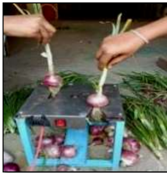
Fig. 3. Battery operated onion root and shoot cutting machine

Battery operated onion root and shoot cutting machine: This machine consists of blade, DC motor and plates assembly which is mounted on top side of stable platform on frame. It operates on charging spray pump battery. The power operated onion leaf and root cutter is operated by 12 watt single phase DC motor having 150 rated rpm. When power is supplied to the machine, the DC motor turns direct current into mechanical energy, which aids in the rotation of the blade. The blade is inserted between the plates, which include two slots for onion insertion, allowing the roots and leaves to be sliced independently. The onions are inserted in the slots manually, after that the cutting of root and shoot bulb moves downward. On a single machine, two people can cut the leaves and roots at the same time.