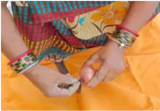
Fig. 2. Manual cutting of onion stem and root (sickle)

Battery operated onion root and shoot cutting machine: This machine consists of blade, DC motor and plates assembly which is mounted on top side of stable platform on frame. It operates on charging spray pump battery. The power operated onion leaf and root cutter is operated by 12 watt single phase DC motor having 150 rated rpm. When power is supplied to the machine, the DC motor turns direct current into mechanical energy, which aids in the rotation of the blade. The blade is inserted between the plates, which include two slots for onion insertion, allowing the roots and leaves to be sliced independently. The onions are inserted in the slots manually, after that the cutting of root and shoot bulb moves downward. On a single machine, two people can cut the leaves and roots at the same time.