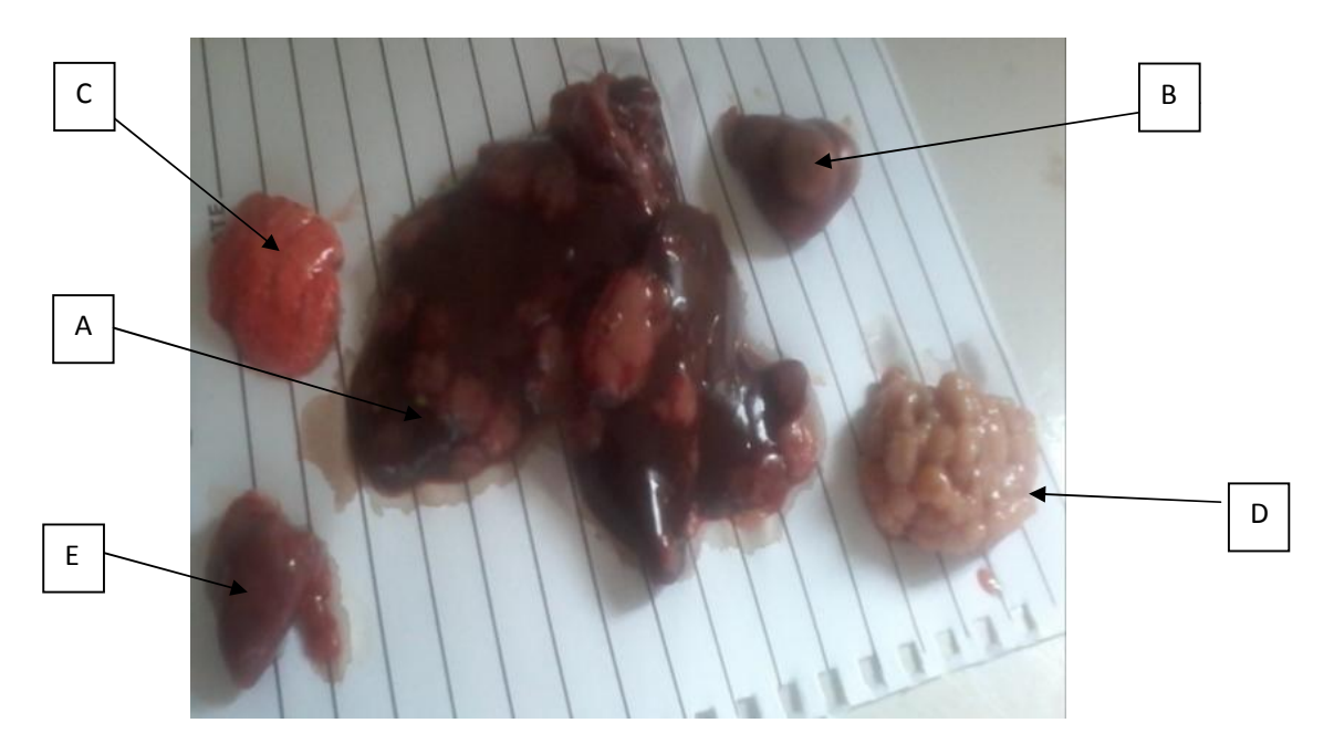
Fig. 1. Photographs of visceral organs of affected chickens markedly affected by nodular neoplastic growth (x 0.5); (A) liver,(B) spleen, (C) lungs, (D) ovary, (E) heart

Diagnosis was made based on history, clinical signs and post-mortem lesions which included the gross and histopathology of affected organs. The clinical signs and pathological lesions were almost similar in both cases. However, the older case showed a more severe involvement.