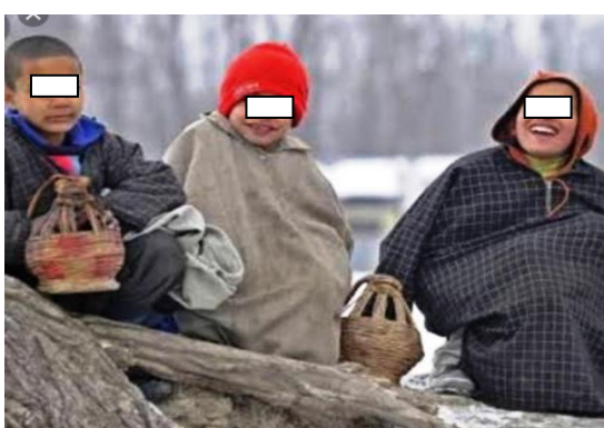
Fig. 7. Body warming by Chinar charcoal