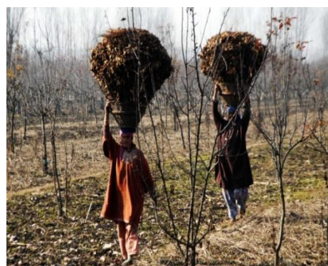
Fig. 2. Packing and transportation