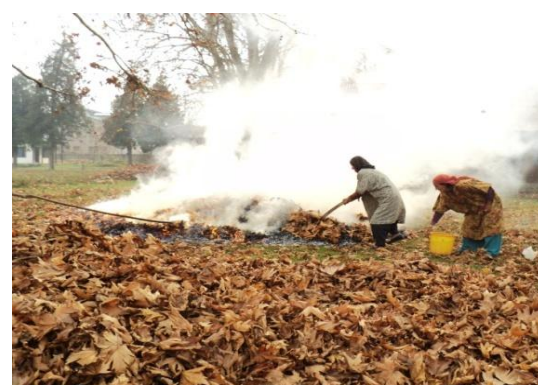
Fig. 8. Drudgery of women in charcoal burning