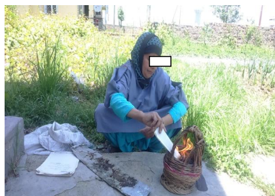
Fig. 6. Kangri burning with charcoal