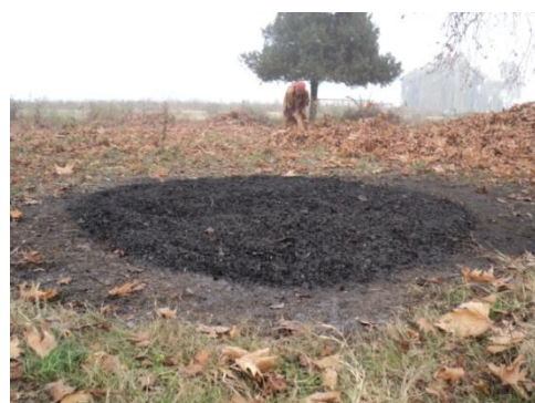
Fig. 4. Drying of Chinar charcoal