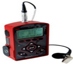
Fig. 1. Noise Integrating Dosimeter

noise or artifact noise, which can occur if objects bump against an unprotected microphone. Dosimeters were typically set up to collect noise measurement data using three different settings for integrating noise to allow comparison of noise measurement results with the three different noise exposure limits referenced in most HHE reports, the OSHA Permissible Exposure Limit, OSHA Action Level, and the NIOSH Recommended Exposure Limit. During noise dosimetry measurements, noise levels below the threshold level were not integrated by the dosimeter for the accumulation of dose and calculation of time-weighted average noise level. The dosimeters averaged noise at a rate ranging from one second to sixty seconds. (See Table 1)