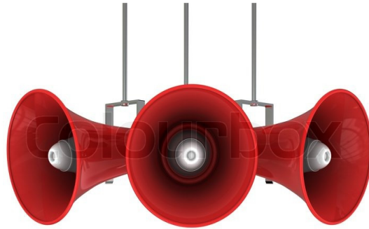
Fig. 2. A typical sample of horn speakers used in most churches and mosques in Nigeria

and energies. From songwriting to studio recording, cassette/CD duplication, live performances in theatres/ auditoria or open spaces, promotion and distribution of recorded music to the final consumer, the music production chain continually interacts with the environment as sonic, electrical, technological and industrial phenomena justifying its study as an anthropogenic factor in climate change as asserted by Holdren [26].