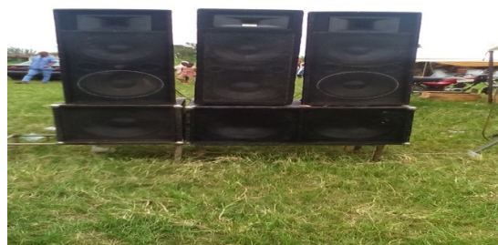
Fig. 4. The speaker system of a band at a social function in Ile-ife

social ceremonies through loud noise/music rather than by invitation cards; the louder the music in a social gathering, the more successful is such ceremony. It is also a common practice for celebrants to show their affluence on such occasions by inviting many musical groups to perform in a singular social gathering. Buttressing the claim on the use of sound for social gathering and party celebration was the case of a funeral ceremony attended recently in Ile-Ife which had eight live bands playing simultaneously at maximum volume level to determine whose sound is the loudest. In such a situation, for example, loudness or amplitude became a selling point for the musician and also a sign of supremacy over one another. This action of multi-musicians performing at and for a particular occasion as orchestrated by a show of class syndrome was a reflection of Nigerian's ignorance on the health dangers acquired through loud sound assimilation. Fig. 4 further expresses the speaker set up of a typical popular musician's bandstand in Nigeria: