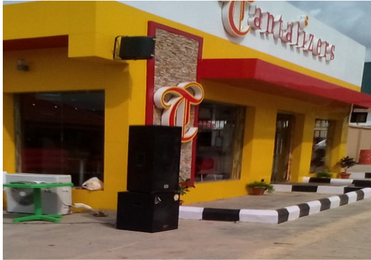
Fig. 3. Tantalizer eatery at Opa area of Ile-Ife, Picture was taken on July 15, 2015

located. Fig. 3 is a photograph of an eatery named Tantalizer at Ile-Ife Nigeria with display of speaker system for sound amplification, which is a typical resemblance of the Tantalizer eateries nationwide: