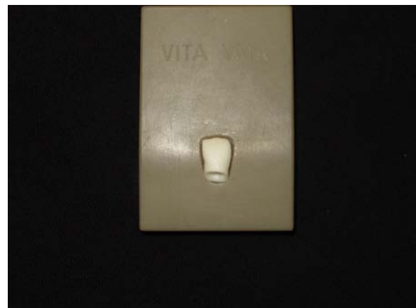
Figure 2. The metal mold used for veneering process.

Group HAS: This group included 10 zirconia-based crowns with screw access holes which were