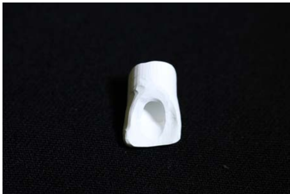
Figure 1. A milled sample of zirconia core with screw access hole before sintering.

out screw access hole, the holes were manually prepared on the palatal surface using a coarse round-end taper diamond bur (ZR Diamond, Komet Besigheim, Germany). To match the dimensions of machinery and manually created screw access holes, a silicone index adapted to the palatal surface was used. Also a digital caliper evaluated the mesiodistal and buccolingual widths of the holes. In case of differences more than 0.1 mm, the zirconia core was excluded from the study. The zirconia cores were divided into three groups: one group without screw access holes for the control and two experimental groups with screw access holes. The zirconia cores were evaluated to ensure uniform thickness of 0.6 \pm 0.02 mm at different areas using a digital micrometer. Furthermore, the zirconia cores were tested by an explorer and a silicone material for their fitness. Also they were evaluated radiographically for marginal adaptation. Finally all the zirconia cores were veneered using a central incisor multi-piece metal index with specific dimensions (11mm in height, 8mm in width) (Figure 2) with a silica-based ceramic veneer (Vintage Shofu-ZR, Kyoto, Japan). The veneer thicknesses were 2 mm for incisal, 1.5mm for midlabial, and 0.5mm for cervical and palatal surfaces. The zirconia-based crown specimens were fabricated as such (Figure 3) and divided into three groups as follows: