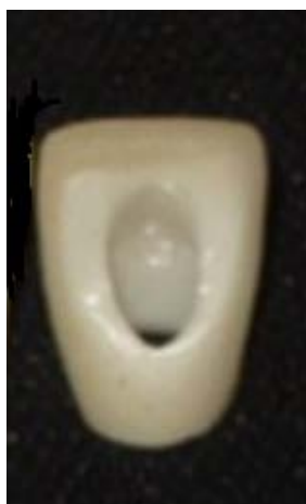
Figure 3. The palatal view of a prepared zirconia-based crown before cementation.

prepared after zirconia core sintering. The holes were manually prepared in the palatal surface of zirconia cores using the mentioned bur, and matched dimensionally to group HBS.