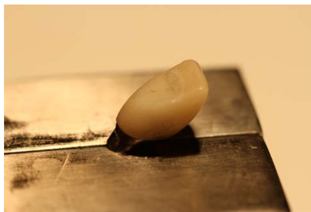
Figure 4. A prepared sample of the NH group for testing.

To determine the fracture load, the specimens were subjected to compressive load testing in a universal testing machine (Z0-50, Zwick Roell, Ennepetal, Germany). Compressive loads were applied vertically and at a 50° angulation relative to the abutments at a crosshead speed of 2 mm/min (Figure 4). 22,24 The load was applied 3 mm below the incisal edge 23 out of the hole area. The load applicator of the universal testing machine was similar to the incisal edge of a mandibular incisor (dimension of 5.5×1 mm), to simulate clinical settings. 25 The magnitude of the load, which was applied by the universal testing machine,