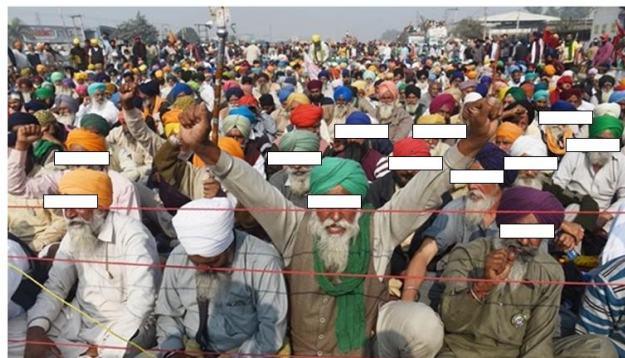
Images: Farmers protesting in New Delhi against Farming Reform Bills passed by the Indian Government in September 2020.