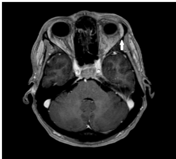
Fig. 1. A cerebral CT scan showed a hypodense lesion infiltrating the left orbit in favor of an orbital metastasis (arrow)

Orbital metastases represent only 1-13% of the processes occupying the orbital space [1]. In a series of 1264 patients with orbital processes referred to an ocular oncology center, 7% were found to be orbital metastases [1]. The incidence of orbital metastases seems to be increasing due to the new anti-cancer therapies allowing a better survival of the patients, and perhaps also due to the increase in the incidence of certain cancers.