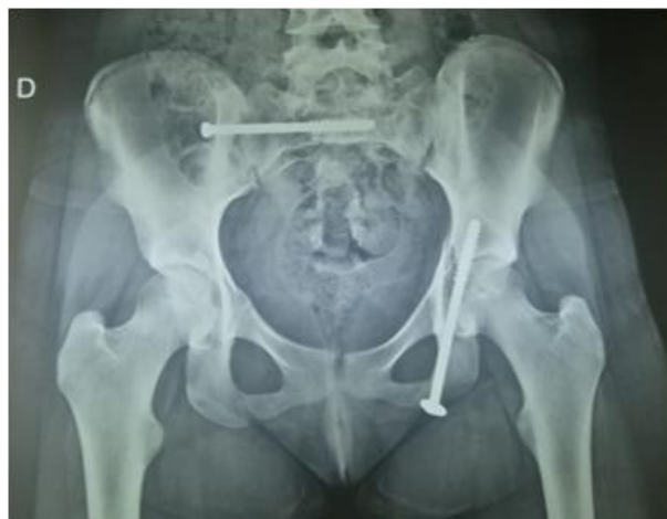
Fig. 4. 45 days post operative X-ray of the pelvis