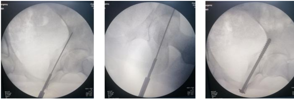
Fig. 2. Retrograde posterior column screw fixation