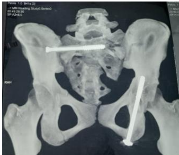
Fig. 3. Postoperative CT scan of the pelvis