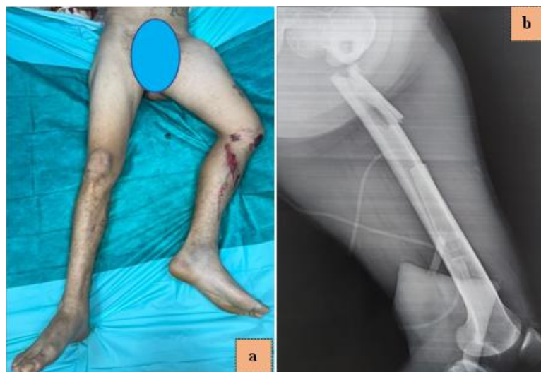
Fig. 1. a: Vicious attitude of the left lower limb with ecchymosis of the front of the knee, shortening of the limb. b: lateral view of the left femur showed the complex femoral shaft fracture with rotation of the proximal parts

Multiple ecchymoses on the left hip, with no vascular or nervous disorders downstream. The oedema of both ankles with retro-malleolar ecchymoses. A traumatic attitude of the left upper limbs with pain and functional impotence, and a posterior angulation deformity of the left arm with a superficial wound on the external face of the left arm with no vascular-nervous deficit. The treatment had been readjusted with macromolecular vascular filling, antibiotic prophylaxis based on amoxicillin and clavulanic acid 1 g/125 mg every 8 h, analgesics based on paracetamol 1 g every 6 hours, Nefopam 20 mg every 4 h, and omeprazole 20 mg per day, oxygen therapy 6 l/min.