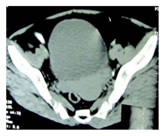
Fig. 3. CT scan of abdomen and pelvis showing disappearance of the ovarian lesion

The present case is interesting due to finding as ovarian mass with simultaneous finding of CML. CML can be associated with granulocytic sarcoma. Most frequently, the tumour presents later in the natural history of CML as the disease progresses. Patients in relapse after chemotherapy or stem cell transplantation can also present with granulocytic sarcoma [13]. Granulocytic sarcoma that develops with chronic phase CML confers a worse prognosis i.e. higher risk of rapid blastic marrow transformation [13]. Granulocytic sarcoma associated with CML responds to imatinib treatment which is evident in the present case in which there is disappearance of ovarian pathology after 6 months course of Imatinib treatment. Therefore, early diagnosis is required to manage the case and to improve survival.