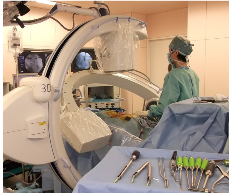
Fig 1. Percutaneous pedicle screw insertion in a two-way C-arm position.

https://doi.org/10.1371/journal.pone.0262089.g001