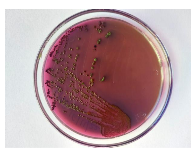
Fig. 1. Morphological characterization of green metallic sheen of E. coli culture on eosin methylene blue agar after 24 hrs incubation

The E. coli was confirmed by PCR by targeting the uspA gene (universal stress protein) following Chen and Griffiths [9] methodology. In the present study, electrophoresis analysis revealed a specific amplification of 884 bp product of the uspA gene (Fig. 2) in test isolates.