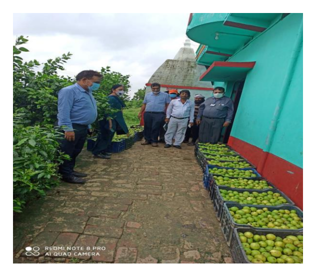
Photographs 1. Photographs of the trail