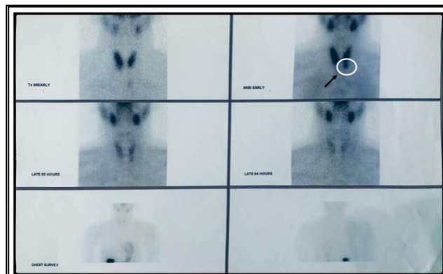
Fig. 2. 99m Tc- Tetrofosmin parathyroid scan report. The circled and arrowed shows increased tracer activity just below the lower pole