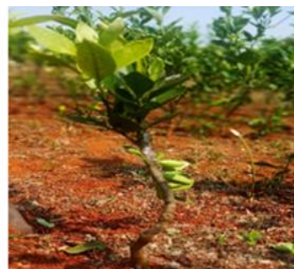
1b. Plant Height