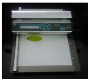
1a. Leaf area meter