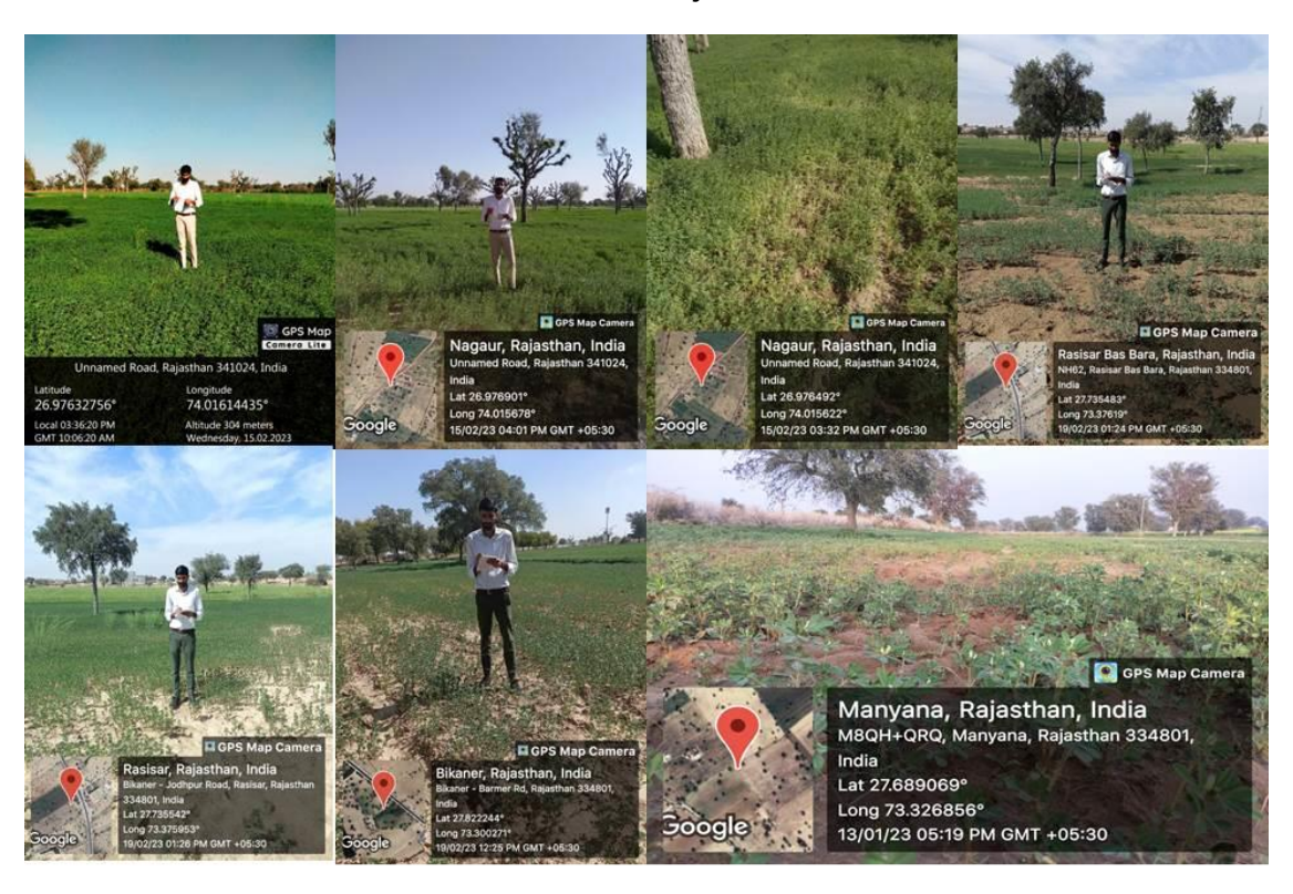
Plate 1. Survey of wilt disease of fenugreek in major growing districts of Rajasthan