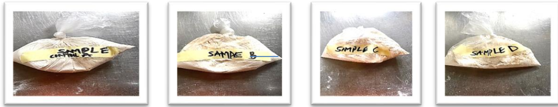
Plate 1. Sample of wheat- African yam bean bread production