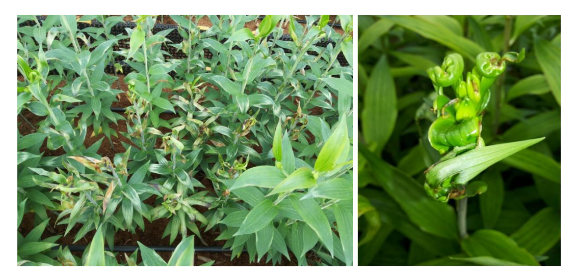
Plate 1. Severely affected symptom of Upper leaf necrosis in Oriental lilium variety 'Paradero'

The occurrence of the symptoms of the necrosis are particularly during the less evaporation days coupled with fewer light or low duration of light and when the transpiration/evaporation of the plants is lesser when compared with highintensity of light ranges. Cocopeat acts as a medium for the growth of plants and the additional supply of nutrients has to be met through foliar application. This will help in reducing the occurrence of upper leaf necrosis symptoms. Foliar application of 1 gram per litre of calcium nitrate and borax applied during 30 to 45 days after planting at 5 days interval help in reducing the incidence of upper leaf necrosis in oriental liliums. The management of proper ventilation system inside the greenhouses by