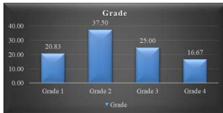
Fig. 2. Distribution of patients by grading of esophageal varices (N=24).