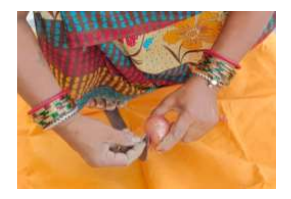
Fig. 2. Manual cutting of onion stem and root (sickle)

Battery operated onion root and shoot cutting machine: This machine consists of blade. DC motor and plates assembly which is mounted on top side of stable platform on frame. It operates on charging spray pump battery. The power operated onion leaf and root cutter is operated by 12 watt single phase DC motor having 150 rated rpm. When power is supplied to the machine, the DC motor turns direct current into mechanical energy, which aids in the rotation of the blade. The blade is inserted between the plates, which include two slots for onion insertion, allowing the roots and leaves to be sliced independently. The onions are inserted in the slots manually, after that the cutting of root and shoot bulb moves downward. On a single machine, two people can cut the leaves and roots at the same time.