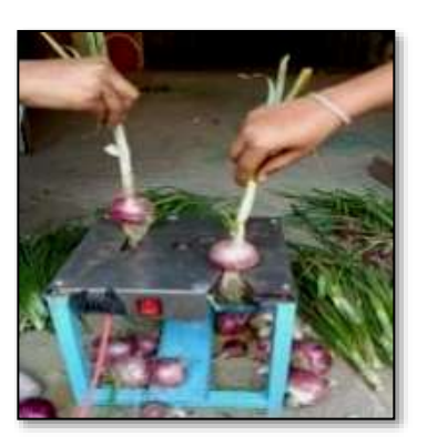
Fig. 3. Battery operated onion root and shoot cutting machine

Battery operated onion root and shoot cutting machine: This machine consists of blade. DC motor and plates assembly which is mounted on top side of stable platform on frame. It operates on charging spray pump battery. The power operated onion leaf and root cutter is operated by 12 watt single phase DC motor having 150 rated rpm. When power is supplied to the machine, the DC motor turns direct current into mechanical energy, which aids in the rotation of the blade. The blade is inserted between the plates, which include two slots for onion insertion, allowing the roots and leaves to be sliced independently. The onions are inserted in the slots manually, after that the cutting of root and shoot bulb moves downward. On a single machine, two people can cut the leaves and roots at the same time.