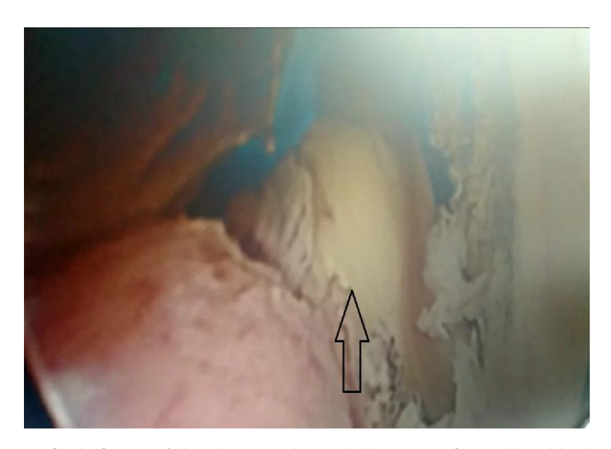
Fig. 2. Cystoscopic drainage of the abscess through the prostatic urethra, black arrow points at yellow-colored thick pus

Cystoscopic deroofing of the abscess cavity was done; around 50 ml of purulent pus was drained. Three -way Foley's catheter was placed for 48 hours and then changed to two-way urethral catheters seven days. Broadfor spectrumantibiotics piperacillin4g and tazobactam 0.5qin combination with meropenem1 gm IV 12hrly instituted for 5 days. No growth of specific bacteria was made in the pus culture sensitivity assay. Tablet Faropenem 200mg two times a day was prescribed for 2 weeks. He becomes symptom-free in 2 days and cured in 3 weeksduration. He has been diseasefree for the past 14 months.