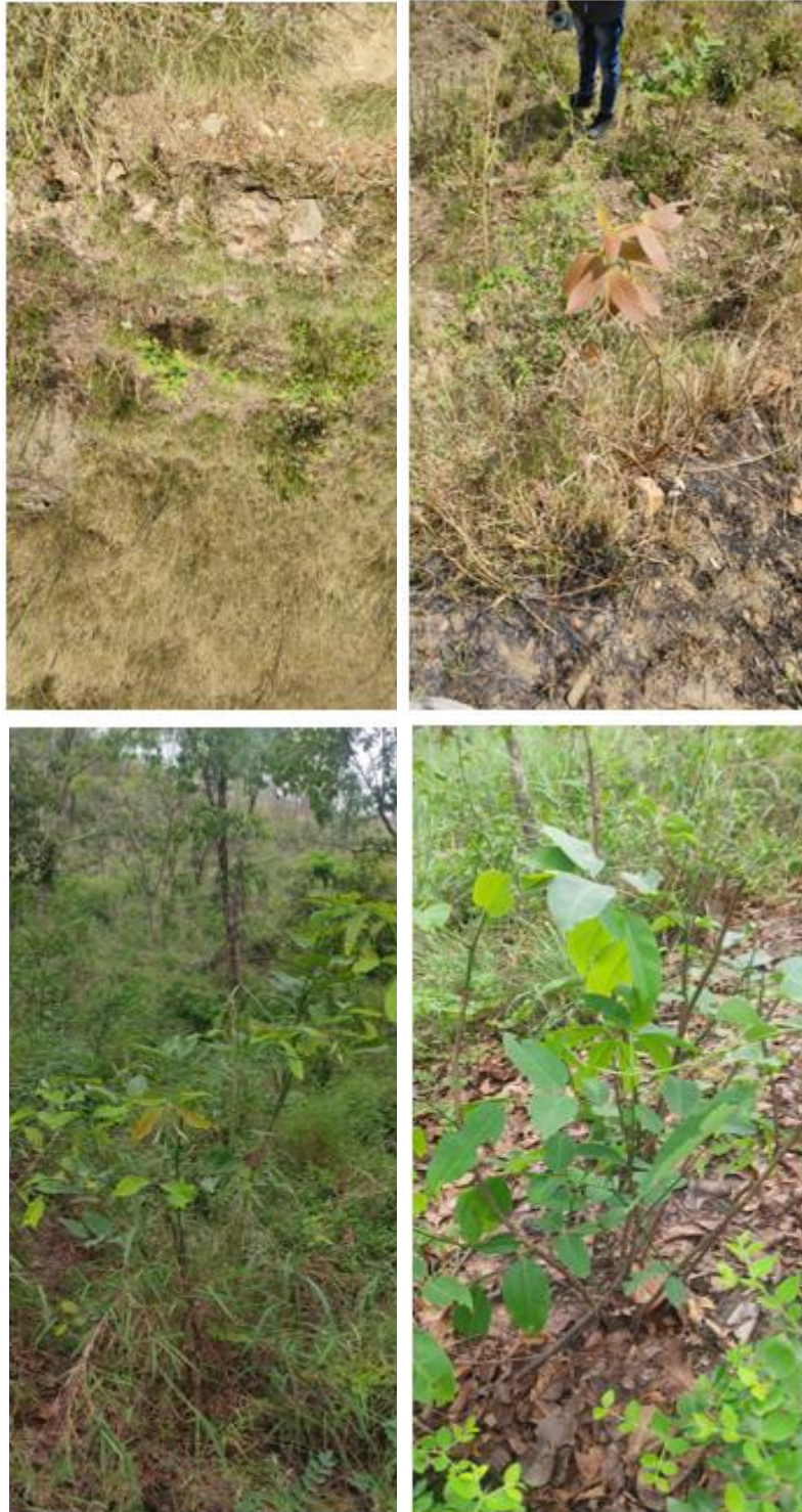
Fig. 1. Some selected plant across Garhwal Himalaya

Parameters related to species' altitudinal range, habitat(s), locality factors (i.e., soil physio-chemical parameters), etc., were gathered. Each location, i.e., habitat, was identified based on the dominance of the vegetation along altitudinal gradient Table 1.