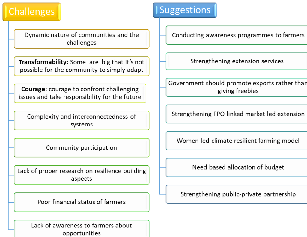
Fig. 2. Challenges in building community resilience

Providing these for mobilizing the farmers in building community resilience in farming.