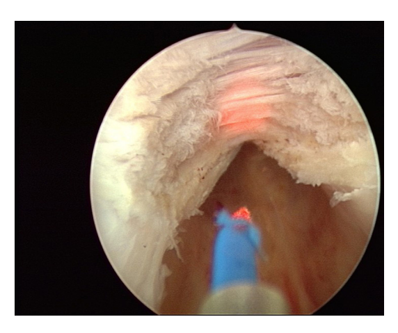
Figure 3 Stricture is opened, cutting the scar tissue at the 12 O'clock position.

from 1980–90, because unfortunately most of the clinical reports of patients who were treated for PFUI or PFUD in 1980–90 were lost to flooding. Finally, full data on the results of our posterior urethroplasty are not reported here, as they were detailed previously [1].