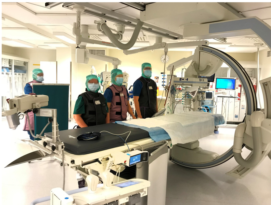
Figure 1. The staff positions during work, from left to right: radiographer responsible for non-sterile tasks, assistant radiographer, second operator and first operator.

dose equivalent H_p(10) dose rate in real-time on a monitor in the room and hence gives direct feedback to the staff. Its cumulated reading was not stored. Our ordinary legal dosimeter (Mirion DIS) was used to measure staff doses in this study. The patient procedures were performed in two adjacent rooms, so the single Raysafe i3 system could not be used for all procedures if two were conducted simultaneously.