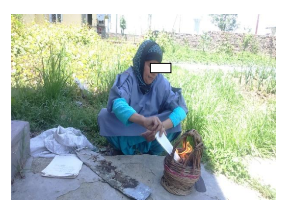
Fig. 6. Kangri burning with charcoal

The charcoal making from Chinar leaf litter is a prevailing household cottage industry securing substantial employment and income opportunities for the indigenous people since