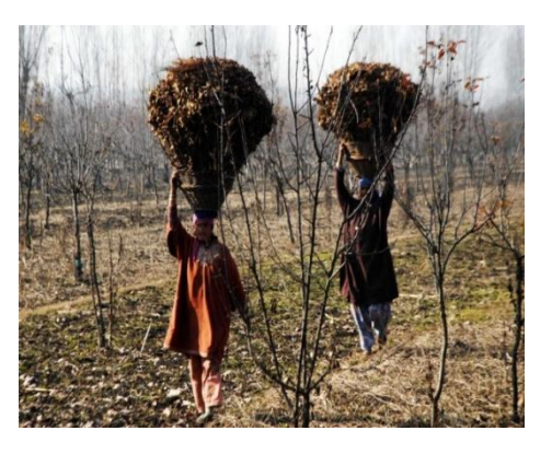
Fig. 2. Packing and transportation

The kangri is a clay-pot filled with glowing embers and enclosed in elegant handmade