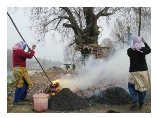
Fig. 3. Charcoal making