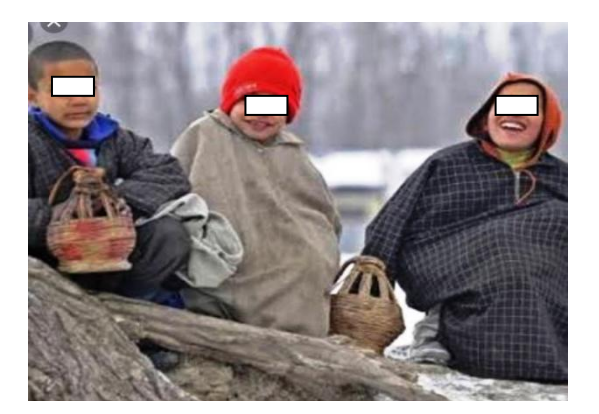
Fig. 7. Body warming by Chinar charcoal