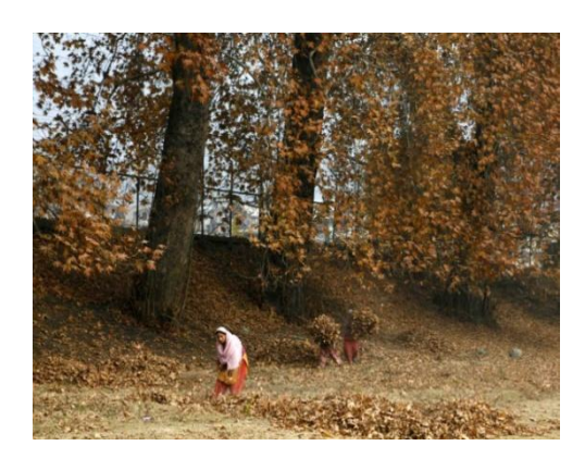
Fig. 1. Collection of Chinar leaf litter