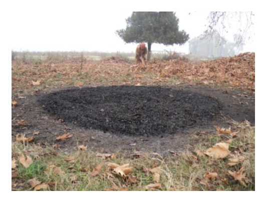
Fig. 4. Drying of Chinar charcoal

wicker baskets which are carried as a personal warmer. It is a traditional fire-pot used by people to keep them warm during harsh winter months. Kangri is a special portable, light, inexpensive and versatile heater that Kashmiri people keep in their pheran. The pheran is a long woolen veil reaching down to the knees worn by almost all Kashmiri people during the cold winters. The manufacture of the kangri involves traditional skill and local artisan's exquisite designs in the craftsmanship. The kanari remains an enduring emblem of local craft that is eco-friendly and cost-effective. The kangri case is weaved from the withies of Indigofera pulchella, Parrotia jacquemontiana, Cotoneaster baciliaris, Salix triandra, etc. The withies collected go through a process of cutting of branches, cleaning, grading, soaking, peeling and drying before final weaving around the bowl-shaped earthenware. The earthen-pots are decorated with shiny colorful threads and delicate designs to provide aesthetic elegance, functional utility and add dignity to people. Kangris are ignited by just 250 grams of Chinar charcoal using wooden or paper torch [Fig. 6]. It is cheaper than oil, gas and wood-fired heaters and costs from ₹70 to ₹ 1500 [Fig. 7].