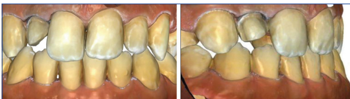
[Table/Fig-5]: Digital bite registration frontal view. [Table/Fig-6]: Digital bite registration lateral view. (Images from left to right)