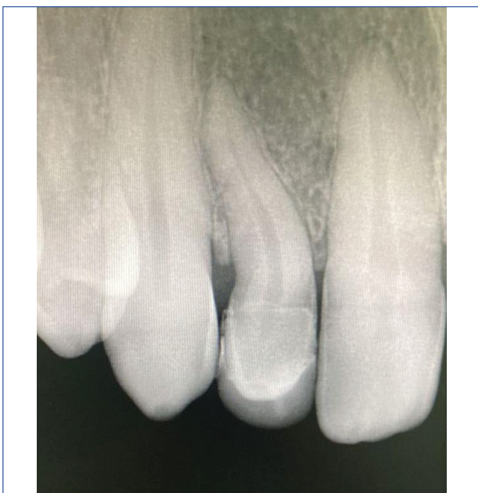
[Table/Fig-11]: Postoperative radiograph.

was instructed to avoid biting on hard substances that might result in fracture or deboning of the ceramic veneer.