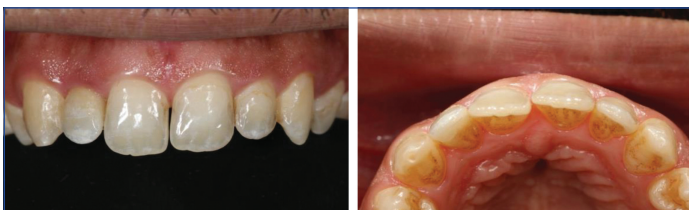
[Table/Fig-9]: Postoperative photograph frontal view. [Table/Fig-10]: Postoperative photograph occlusal view. (Images from left to right)

ivoclar vivadent) was used to verify for marginal adaptation, fit of the restoration, as well as interproximal contacts, and occlusion. A fine diamond bur (Brasseler USA) was used for minor adjustments to the interproximal contacts. These contacts were then polished making use of chairside ceramic polishing kit (Brasseler USA). After the final outcome was approved by the patient, 9.5% hydrofluoric acid as an etchant for 20 seconds with silane applied and air dried (monobond plus, ivoclar vivadent) was used on all the internal bonding surfaces of the laminate veneer. The prepared laminate veneer was then cemented with the use of a translucent light-cure resin cement (variolink esthetic LC, ivoclar vivadent) after following the manufacturer's instructions. Excess material cement was removed from the tooth margins and eventually cured using a VALO Grand LED Curing Light (Ultradent Corp) for 10 seconds according to manufacturer's instructions [Table/Fig-9-11]. Patient