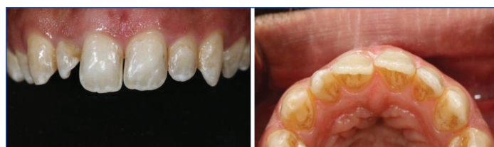
[Table/Fig-1]: Preoperative photograph frontal view.

Preoperative photograph and initial upper and lower impression were obtained [Table/Fig-1,2]. The lingual surface of the ceramic veneer was prepared using a butt joint margin, a reduction of 1.5 mm was done on the incisal edge and 0.3-0.8 mm on facial surface utilising a round-ended diamond cutting bur (Brasseler, Savannah, GA, USA). Final preparation was then finished and polished using Soflex disc (Sof-Lex™, 3M, USA). Soft tissue and marginal exposure management were out by utilising retraction cord (size 000, Ultrapak, Ultradent Inc, USA) and Astringent retraction paste (3M ESPE retraction capsule, 3M, USA).