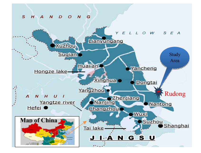
Map.1. Study Area

It is located on the bank of the Yellow Sea [12]. Nantong city is located in Jiangsu province on the northern bank of the Yangtze River, near the river mouth. It has an area of 8,544 Km<sup>2</sup> with a population of about 7.3 million people of 2010 census. Nantong is a vital river port bordering Yancheng to the north, Taizhou to the west, Suzhou and Shanghai to the south across the river and the East China Sea to the east [13]. The author chose Jiangsu for the study because is among the three largest producers of White-leg shrimp ( Penaeus vannamei ) in China. Nantong city is the largest shrimp producer in Jiangsu province of which Rudong county stands out as the largest contributor [12].