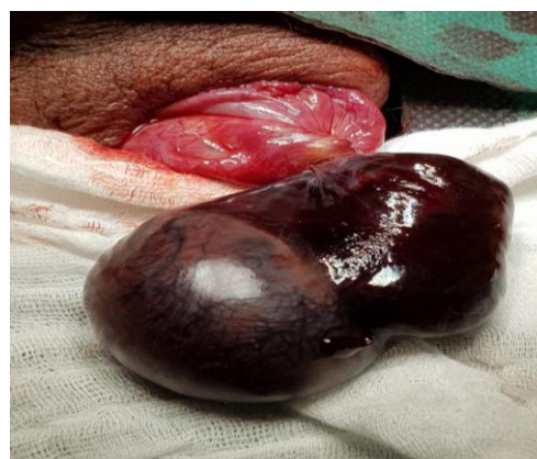
Image 3. Necrotic testicle a twisted spermaic cord

The prognosis correlates with the earliness of the procedure. The overall rate of testicular preservation after torsion is 40% to 70%, but we have 100% preservation before 3 hours, 90% before 6 hours, and less than 50% after 10 hours [14]. A lack of suspicion of testicular torsion in elderly patients may result in a missed or delayed diagnosis, compromising the chances of testicular salvage [3].