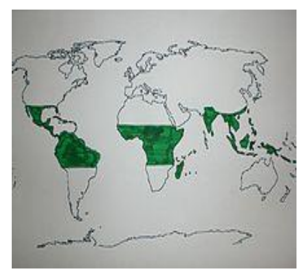
Fig. 2. Jatropha distribution [11]