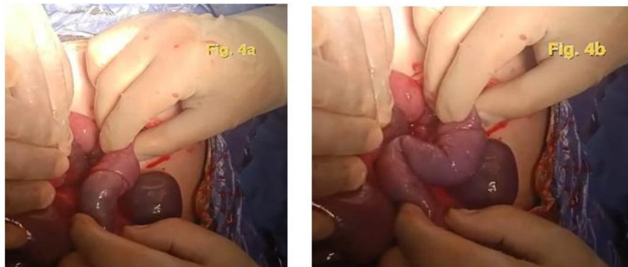
Fig. 4. A. Intraoperative ileoileal intussusceptions; B. Intraoperative successful manual reduction

Surgery for gastroesophageal reflux disease, neuroblastoma, and Hirschsprung's disease is linked to an increased risk of POI [9]. Additionally, appendectomy, Meckel's diverticulum, and retroperitoneal malignancies are common causes of intussusception. As previously documented by Sule Yalçin et al., POI seldom occurs following gastropexy [10], which is what happened in the current case.