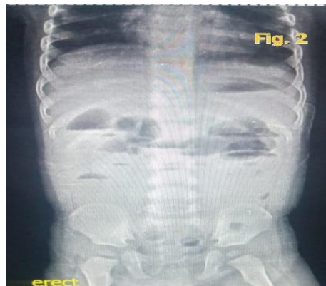
Fig. 2. AXR 2 nd day post-operative showed multiple air fluid levels