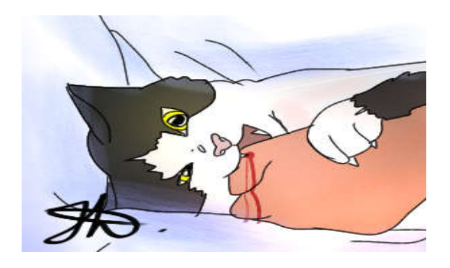
Fig 2. Extremities are common site of Cat bite

The Cat bites account for 5% to 15% of animal bite wounds. Cat bites occur most often in adult women, usually on the extremities. (Fig. 2) 20% of the bites require medical attention.