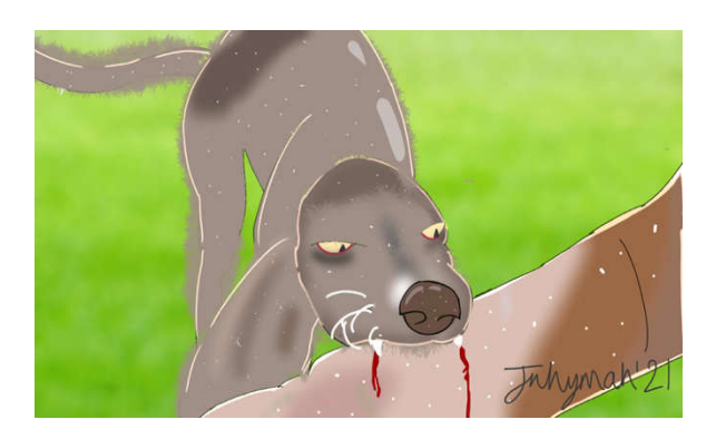
Fig 1. Dog bite sometimes can be fatal

The dog bites account for 80% to 90% of domestic animal bites in the United States.